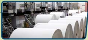
PAPER & PULP

QUALICOM has designed & installed water & waste water treatment system across industries.